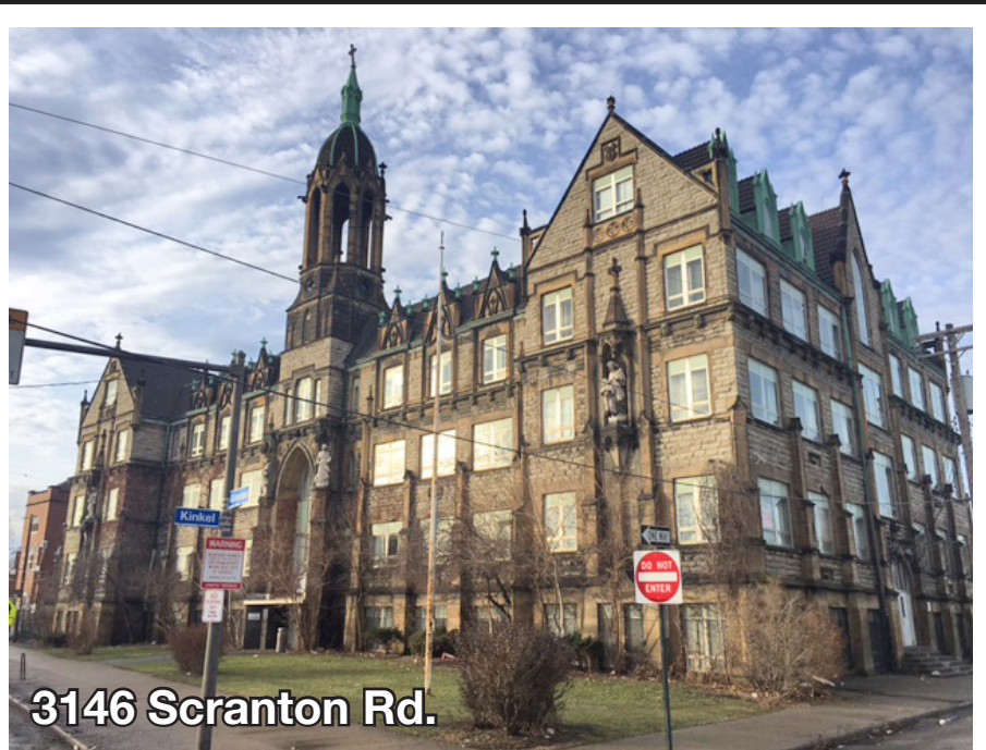
3146 Scranton Rd.