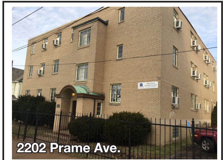
2202 Prame Ave.